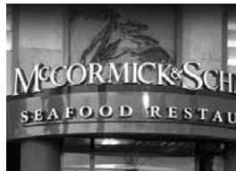
McCormick & Schmick's